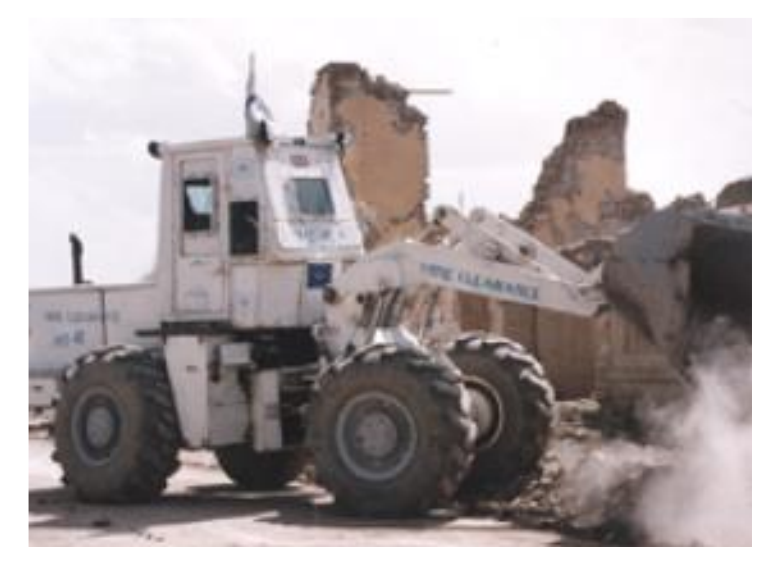
Figure 2: Armoured Front-end Loader removing rubble (Reference: IMAS TN 09.50/01)