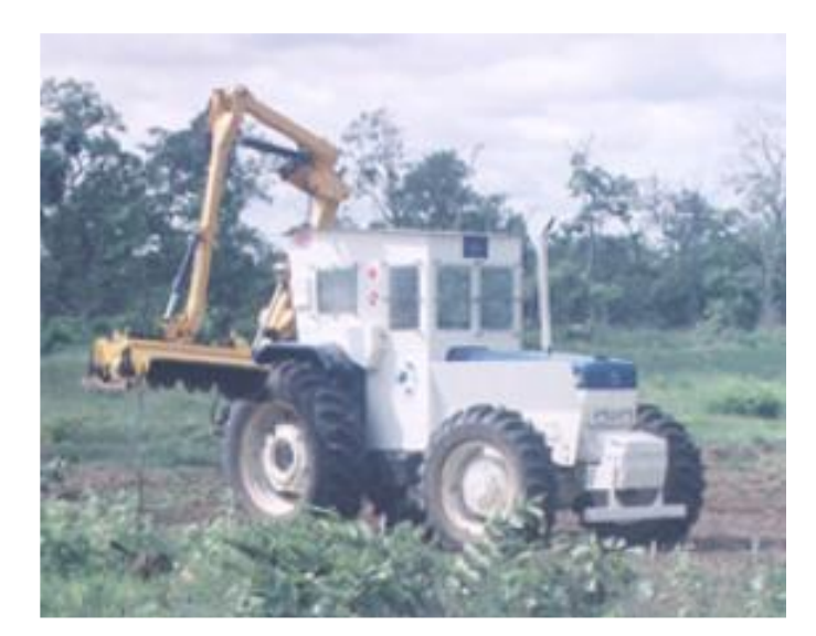
Figure 3: Armoured Tractor fitted with Vegetation Cutter ( Reference: IMAS TN 09.50/01 )