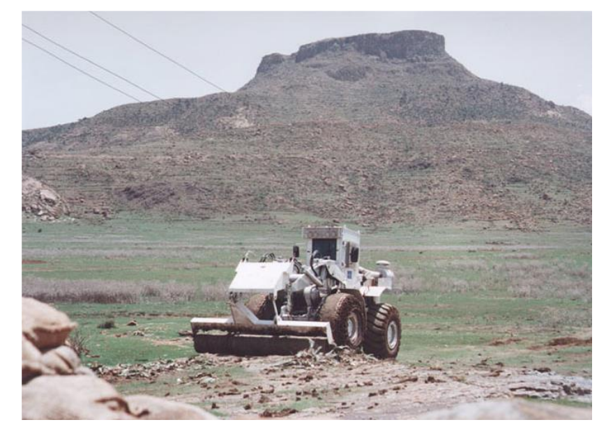
Figure 1: Armoured Front-end Loader with AP Mine Rollers (Reference: IMAS TN 09.50/01)